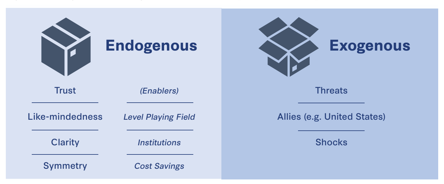
Figure 3: Endogenous and exogenous factors in European defense cooperation